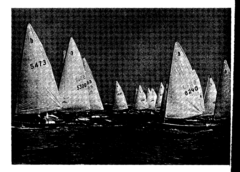
(See Pages 19 & 20 for Complete Results)

Part of 43-boat senior Penguin fleet bunch up shortly after start of opening race (July 20) on Little Egg Harbor Bay.