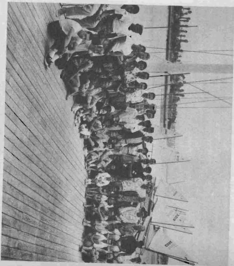
The Championship Gang at Los Alamitos