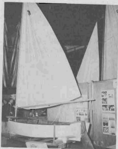
Chesapeake Bay Boat Show