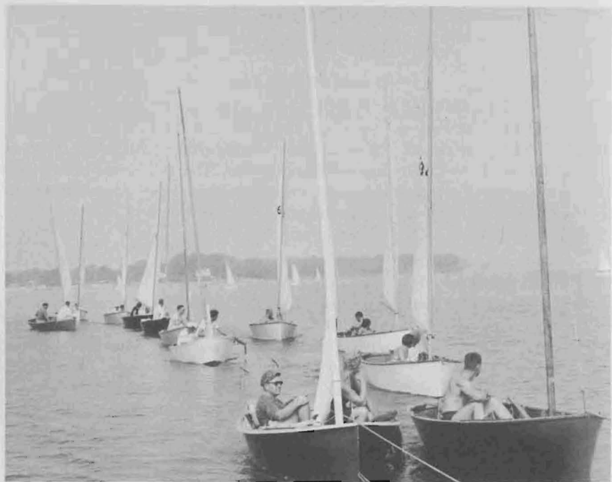
Towing to the Starting Line . . .