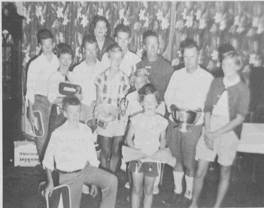
All the Trophy Winners!