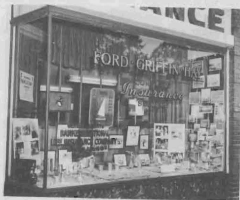
Window Display, Baltimore, Md.