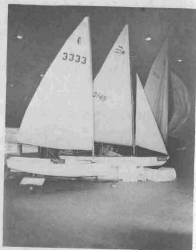
Sportsmen's Show, Washington, D. C.